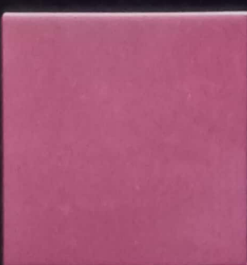
Rose Pink Pearl