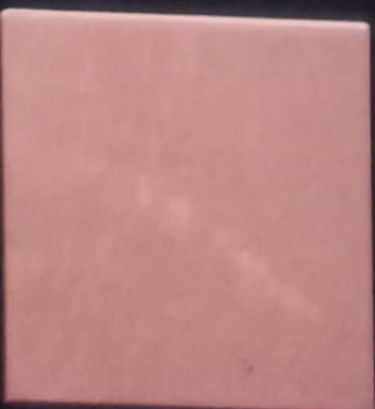
Soft Pink Pearl