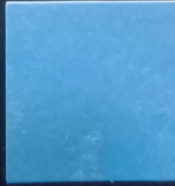
Capri Blue Pearl